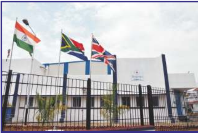
Khopoli Plant - Finished Dosage Forms